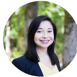
Rep. Wlmsvey Campos