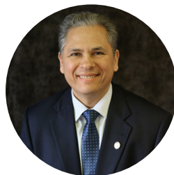
Rep. Mark Meek