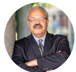
Sen. Lew Frederick