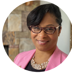
Rep. Janelle Bynum