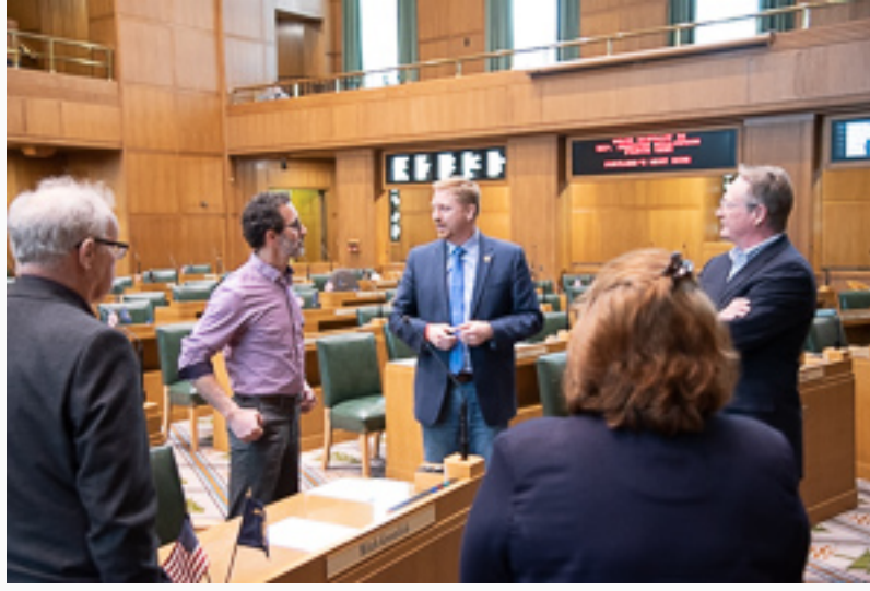
Central Oregon Community College comes to the Capitol.