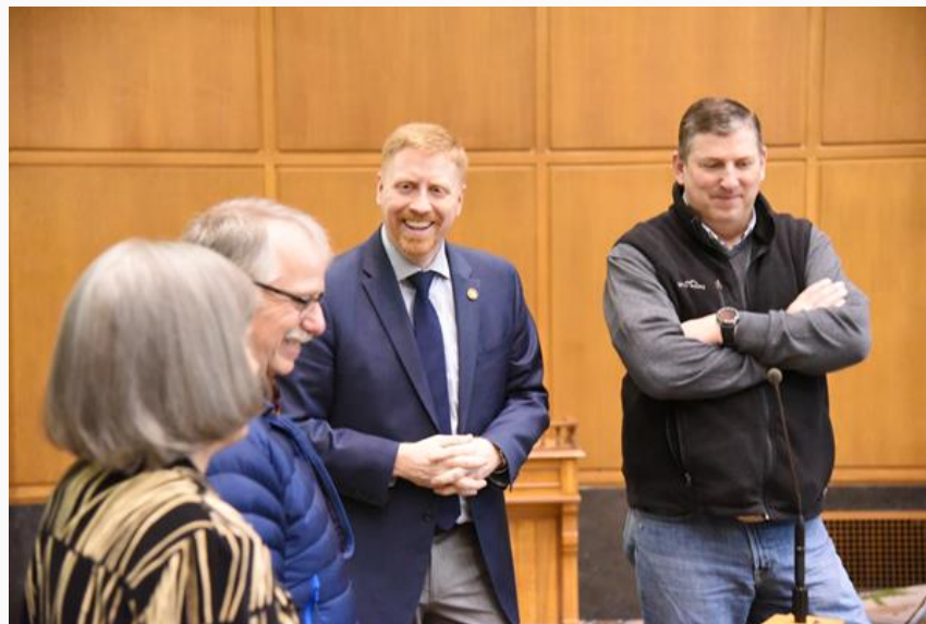
Jefferson County Commissioners on AOC Lobby Day