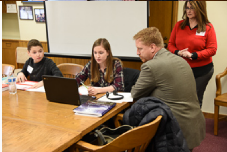
Passionate advocates make the