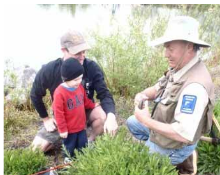
Volunteer at fishing event in Bend.

In addition to seven days of youth angling clinics during Kokanee Karnival, the STEP biologist coordinated three youth angling events at Pine Nursery and Shevlin Pond in Bend.