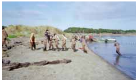
Coquille High students seine for juvenile salmon.

The most important monitoring operation that volunteers are involved with each year is the fall Chinook salmon recruitment surveys that are conducted in the Coos and Coquille estuaries. In the Coos River Basin volunteers release in excess of two million Chinook salmon juveniles annually. With the large numbers of fish released, an evaluation of the impacts on wild Chinook salmon is needed. One way to measure the impacts is to monitor the growth and abundance of Chinook salmon in the estuary.