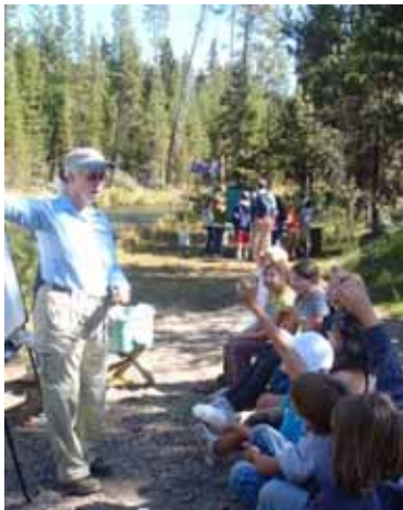
Students at Kokanee Carnival.