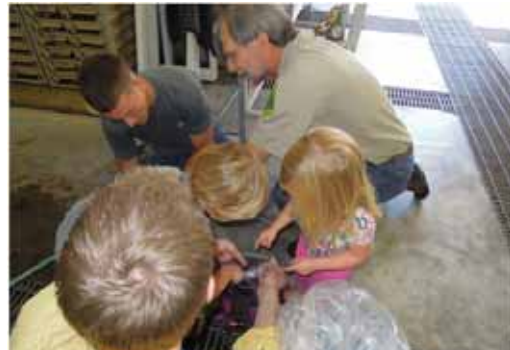
Two young volunteers getting backpacks loaded with fish

STEP staff coordinated the bi-annual backpack and horseback stocking event for the High Cascade Lakes. Volunteers packed approximately 58,000 fingerling cutthroat and rainbow trout into 62 High Cascade Lakes. This continues to be enormously popular, and requires significant coordination from staff.