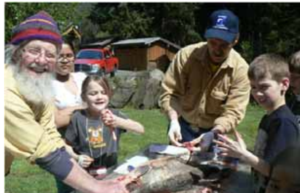
Mid Coast STEP volunteers leading a steelhead dissection

Mid Coast STEP also partnered with the Hatfield Marine Science Center for several of their summer Sea Camp programs, as well as education days with eighth graders from the Lincoln County School District. In addition to fish dissections, Mid Coast STEP led an estuary seining trip in Yaquina Bay for camp participants to learn about juvenile fishes. Participants in the Fisheries Investigation Sea Camp also spent a day at the Siletz Falls fish trap learning about adult salmonid identification, fisheries management, aquatic insects, food webs, and salmonid biology.