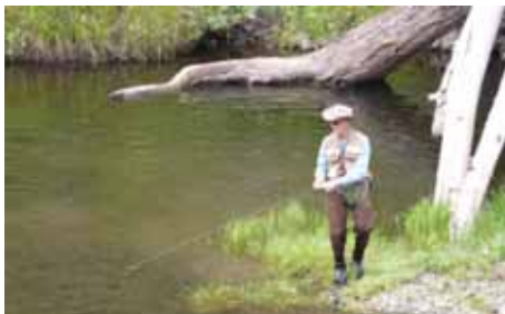
Hook and line sampling on N. Fk. Crooked River.

The district biologist and STEP biologist coordinated and supervised volunteers who assisted with electrofishing and hook & line population surveys on the North Fork and South Fork Crooked Rivers. Volunteers assisted biologists by hiking into remote areas, carrying sampling gear, netting fish, and collecting biological data. The North Fork and South Fork Crooked River often provide excellent angling opportunities to anglers willing to hike into remote areas and get away from the crowds.