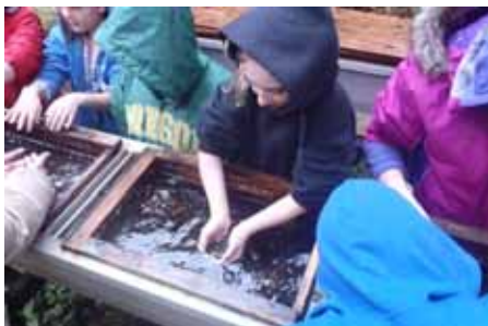
Students observing and handling fry being reared at Millicoma Interpretive Center.

During the report period, volunteers, staff, and students operated the South Coos River Trap as part of the monitoring and evaluation project. A total of 2,323 Chinook salmon were captured, marked, and released into Coos River. The trap was also used to conduct a Peterson Mark Recapture Population Estimate of Chinook in the South Coos River. The ODFW staff estimate of Chinook salmon in the South Coos River basin based on the information gathered was 9,404 adults and 1,174 jacks.