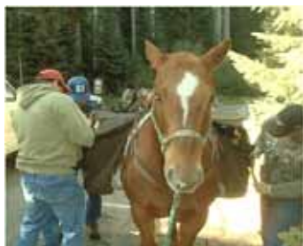
High Lake Stocking Volunteers

The STEP program also coordinated the district's High Lakes stocking using volunteers from Oregon Equestrian Trails. Volunteers stocked 11 lakes in the district with over 14,000 brook trout and 3,000 rainbows. Over 35 volunteers assisted with this year's stocking and again the project was very successful.