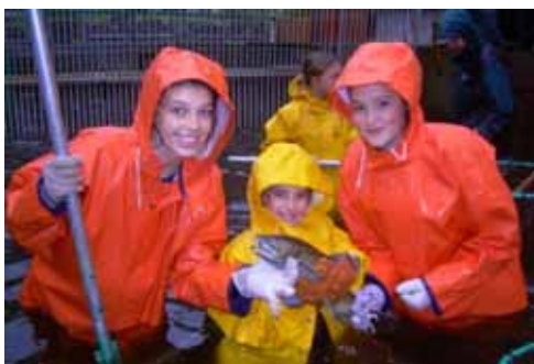
Youth of all ages help gather and spawn broodstock.

Broodstock collection and development programs in the District continue to be a success overall. Volunteers involved in the collection of naturally produced salmon and steelhead for incorporation into hatchery programs donated a significant amount of time. The collection of naturally produced salmonids is always very labor intensive. For more than twenty years, a significant proportion of the steelhead has been acquired through angler donations. In the Coos River basin, about forty percent of the steelhead broodstock were again donated by anglers.