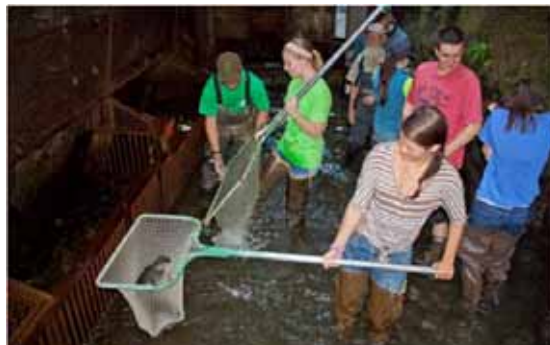
Fisheries Investigation Sea Camp participants operating the Siletz Falls fish trap

Five Oregon State University (OSU) interns were also hired and trained to assist with trap operations on the North Fork Alsea River, Siletz River, Palmer Creek, and Drift Creek. In addition, interns assisted with broodstock collection, snorkel surveys, estuary seining, and family fishing events. District volunteers and OSU interns also assisted ODFW staff with spawning surveys in the Siletz and Alsea basins, and the Depoe Bay Salmon Enhancement Commission completed spawning surveys on North Depoe Bay Creek.