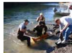
Chetco Brood Collection

Volunteers and fishing guides assisted ODFW staff in collecting broodstock for the Chetco River hatchery programs. A total of 129 fall Chinook salmon and 112 winter steelhead were collected and transported to Elk River Hatchery.