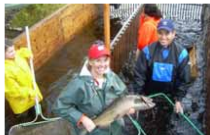
Volunteers operating the Dellwood fish trap.

The District STEP biologist coordinated the collection and distribution of salmon and steelhead eggs from ODFW hatcheries or STEP incubation facilities to volunteers. As a result, 164,317 fry were released from a variety of hatchboxes in the Coos and Coquille basins. Most of the unfed fry releases are conducted as a rehabilitation project. The fry are released above human-made barriers to upstream migration of salmonids. The barrier, such as a culvert, has been or is scheduled to be corrected. Coho salmon are released for one life-cycle of three years. The Chinook salmon fry releases in the Coquille River basin are conducted for the purpose of a payback program. These fry are a replacement for the loss of production of wild Chinook salmon that are taken and used in the lower river smolt program.