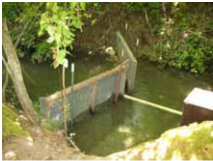
Griffin Creek fish trap.

The hoop trap in Lazy Creek was placed to allow us to sample and study Klamath small scale suckers. Volunteers from St. Mary's School captured and measured 26 Chinook salmon fry, eight juvenile steelhead, one sculpin, and exotic species including twenty redbreasted sunfish, 57 banded crayfish, and two juvenile brown bullheads. Based on past years' data, we believe that the suckers are using Lazy Creek for spawning. Because of the late installation date of May 8 th in 2012, we were unable to capture Klamath smallscale suckers during the 2011-2012 sample