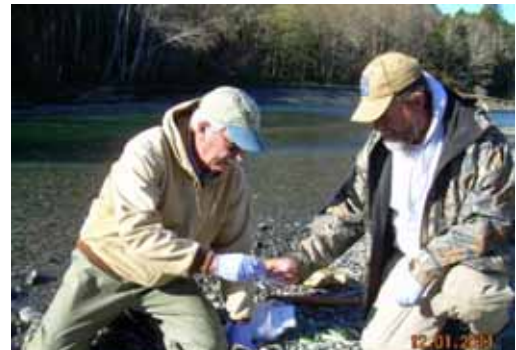
Chetco River Scale Collection

Oregon South Coast Fishermen volunteers assisted in an intensified fall Chinook salmon scale sampling effort conducted on the Chetco River. The sampling effort is planned to improve data on age and hatchery/wild composition estimates for the Chetco River. The volunteers used drift boats and covered the mainstem reaches while ODFW sampled in the tributaries. During the 2011 brood year volunteers and staff collected 660 samples.