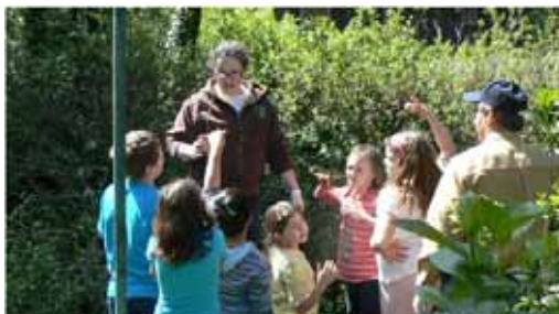
Students learning about aquatic food webs and steelhead habitat prior to fry release

During the 2011-2012 school year, the Fish Eggs-to-Fry classroom incubator program was active at the Beverly Beach Visitor's Center, Neighbors for Kids After-School Program, and in 39