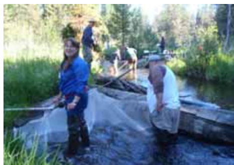
Teachers learn about fish sampling

The Eastern Oregon STEP biologist and Malheur District Biologist instructed and helped coordinate a week-long teacher workshop, "Creeks and Kids," also coordinated by Western Oregon University and funded through ODFW's Fish Restoration and Enhancement Program. Teachers were taught stream and fisheries related activities to enhance their school curriculum. The majority of their activities are drawn from the STEP publication, The Stream Scene . The STEP biologist was responsible for field and classroom instruction of trout sampling methods