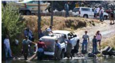
Indian Creek Fish Release

Wild Lower Rogue fall Chinook salmon broodstock are collected, transported, and spawned at the Indian Creek Hatchery STEP facility. The resulting offspring are incorporated into a smolt program for supplementation of Lower Rogue Chinook salmon stock. A total of 83,325 fall Chinook salmon were marked and reared to smolts by volunteers. The full sized smolts were released into the Rogue River estuary in the late summer of 2012.