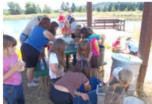
Aquatic Sampling at Adair Summer Program

In spite of the growing human population and resulting changes to the landscape the Willamette River Basin continues to support a diversity of fish. Native among these include spring Chinook salmon, winter steelhead, rainbow and cutthroat trout. Several salmonid species have also been introduced including fall Chinook salmon, coho salmon, and summer steelhead. Although the focus of STEP efforts in this area is upon the native salmonids, the program through its educational, monitoring, and habitat efforts also provides benefits to the basin's many other native fish.