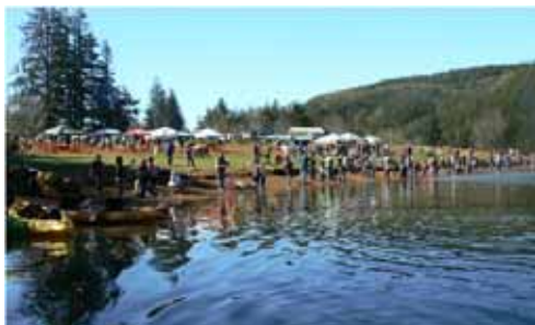
Participants at a Family Fishing Event.

Volunteers led five successful family fishing events in the Mid Coast at Olalla Reservoir, Eckman Lake, Big Creek Reservoir, Cleawox Lake, and at the Lhuuke Illahee Fish Hatchery near Siletz. Additional youth angling events were offered at the Salmon River Hatchery and at Thissell Pond by Alsea Hatchery staff and volunteers.