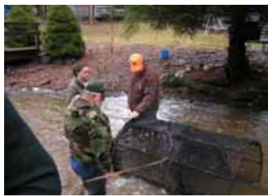
Hoop Trap on Bitterlick Ck.

The Small Stream, Urban Stream, Intermittent Stream Project of monitoring and outreach continued to be a focal point of the STEP program in the Rogue Valley. This effort is aimed at the following: creating awareness of the fish resources using these streams, in order to promote stewardship and protect habitat; gaining additional fish distribution information; and developing interest and support for restoration actions on individual streams.