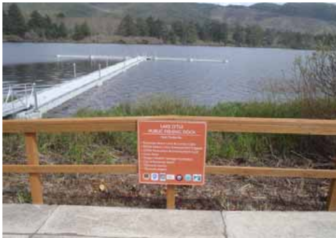
Replacement Lake Lytle Fishing Dock

Bay Watershed Council in securing another grant to implement the design beginning spring of 2012. The project is currently under construction and is scheduled for completion June 2013.