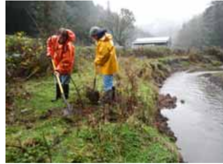
Planting trees on stream bank.

Habitat restoration projects are an important component of the volunteer projects in the district. The largest habitat improvement project conducted by volunteers, mostly hosts at the facility, involved the planting of hundreds of trees along Morgan Creek and a newly restored wetland area nearby. Douglas Fir and Western Red Cedar were the only trees planted this year at the location. Prior to planting, about one-half acre of blackberries were removed.