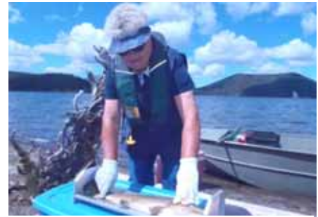
Volunteer collecting data on trout during East Lake Chub removal project.

Three popular trout fishing lakes (East, Paulina, and Lava) have deteriorated due to an overpopulation of invasive chub. As part of a five year chub control plan, OSU Cascade interns and volunteers are mechanically removing chub with trap and fyke nets. The STEP biologist and district staff directed the efforts of the interns. Trap nets are set on the shoreline during chub spawning season, and nets are emptied daily. The interns and volunteers are trained to set the nets, remove fish from the nets, haul fish to the disposal site, and collect biological data. In conjunction with mechanical control, ODFW will implement a modified fish stocking program to enhance biological chub control through the use of piscivorous rainbow trout. In 2012, STEP volunteers, along with ODFW staff, removed 20,000 pounds of chub from these lakes.