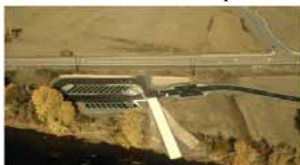
Nichols Park Boat Ramp, opened fall 2012

The Nichols Park boat ramp project located on the South Umpqua in Winston was completed this past fall. This will open up over 11 miles of river access to anglers for winter steelhead and smallmouth bass. The Umpqua Fishermen Association (UFA) is working on a possible phase II that will involve an acclimation site as well as an educational outreach center.