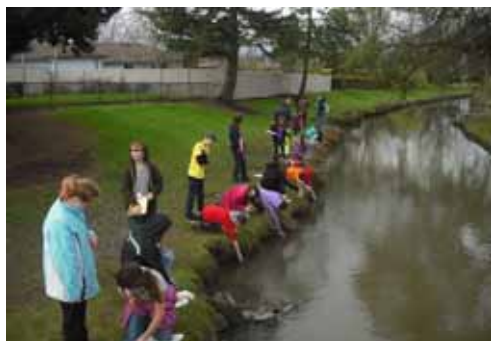
Students Releasing Fry

The Egg to Fry Classroom Program within the District is for educational purposes only and is not intended to contribute to fish production goals. However, as an educational program, it is