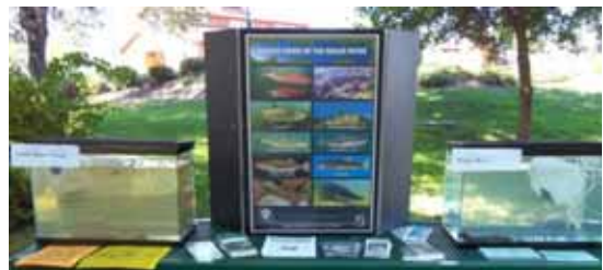
Display of the water in Little Butte vs. the Rogue

The Upper Rogue STEP district includes most of the Rogue watershed extending from the headwaters near Crater Lake downstream to Mule Creek near the community of Agness. Cole Rivers, an early Rogue District Fish Biologist, estimated there were about 2,400 miles of stream in the basin. The Rogue watershed has the largest human population of any coastal watershed in Oregon. Approximately 400,000 people live in the district, posing challenges for fish and wildlife resources but also providing a large number of schools, service clubs, sportsman's clubs, and volunteers to assist in various STEP projects that educate citizens and improve fish habitat throughout the basin.