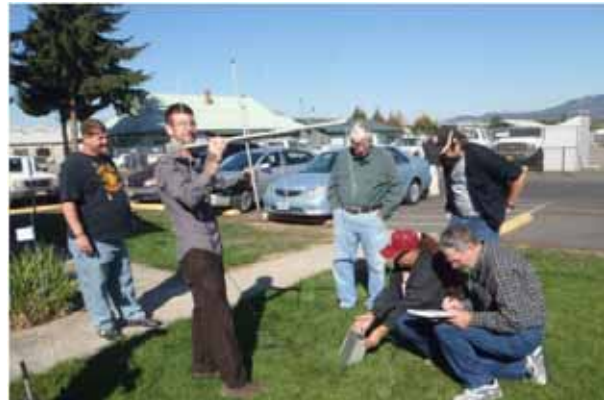
STEP volunteers attend a radio tracking training.

STEP volunteers participated in an angler mark-recapture population estimate for rainbow trout on a five mile reach of the McKenzie River. The project was intended to determine a baseline population size (fish per mile) of rainbow and cutthroat trout following the cessation of stocking hatchery rainbow trout in the reach. STEP staff conducted training for volunteers regarding how to floy tag fish and record data.