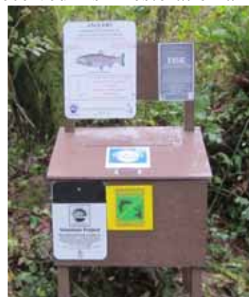
Snout Collection Station

During the summer two snout recovery stations were built to be located at several boat ramps. Volunteers solicited prizes to raffle to anglers that donated tagged snouts. Each of the newly built stations will have cards for anglers to fill out to include with the snout. If the card is filled out correctly and the snout has a tag the angler will be entered into drawings that will be conducted throughout the 2012 season.