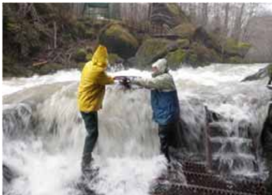
Mid Coast STEP volunteers trying to shut down the Siletz Falls fish trap head gate during a winter storm

This year wild winter steelhead broodstock collection programs on the Alsea and Siletz Rivers were supported by 36 volunteer anglers. Wild winter steelhead are spawned at the Alsea Hatchery to enhance smolt stocking in these rivers. The hatchery winter steelhead program on the Siuslaw River was also supported by over 96 volunteers. STEP volunteers collect winter steelhead for broodstock at Green Creek, Whittaker Creek, and Letz Creek in the Siuslaw basin. The Florence STEP group also spawned Coho salmon at the Munsel Creek trap to use as broodstock for a small educational program at the Munsel Creek hatchery.