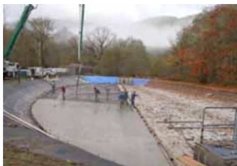
Installing new lining in Rhoades Pond.

Astoria High School's hatchery program released 34,750 coho salmon and 19,485 Chinook salmon presmolts into Young's Bay. Warrenton High School's program released 5,623 coho salmon, 7,936 Chinook salmon, and 350 winter steelhead presmolts into Skipanon River.