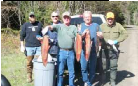
Carcass Placement Crew

A total of 42 volunteers from eight different groups placed 2,048 (6,874 pounds) of salmon and steelhead carcasses in four stream reaches totaling 12.2 miles. There were 1,536 coho salmon carcasses placed in Taylor, Sugarpine and the West Branch of Elk Creeks, and 512 steelhead carcasses placed in the South Fork of Little Butte Creek.