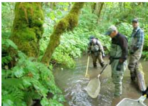
Electroshocking as part Cutthroat Study

In the Salem area, students from Jane Goodall Environmental Middle School and other local high schools assisted the STEP Biologist to sample local streams with seine nets and electroshocking. Students collected fish, macroinvertebrate, and habitat data on two reaches of Pringle Creek; one above and one below where the creek goes underground for several hundred feet. Data from the sampling efforts will be used to produce a fish presence report on Salem area streams. The report will be made available to City, County, and State Agencies, as well as citizen groups and watershed councils.