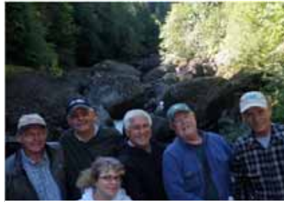
STAC members at the Siletz Falls

Three vacancies occurred during this time period and work was done to recruit and appoint replacements.