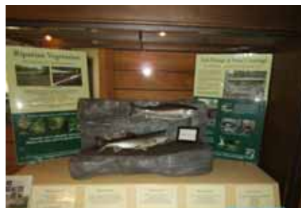
Display at Harnish Wayside