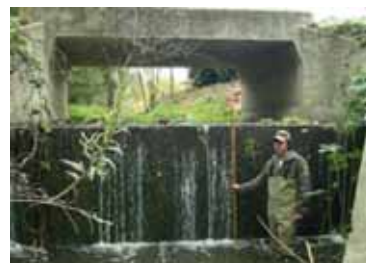
Fish Passage Barrier on Lazy Ck.

Fish passage checks were performed in the early fall and after each major freshet by volunteers at 30 culverts and fish passage structures in Josephine and Jackson Counties. Department personnel were called in when culverts or fish ladders became plugged after freshets. Six volunteers drove 839 miles and worked 150 hours to check fish passage at the structures in 2011-2012.