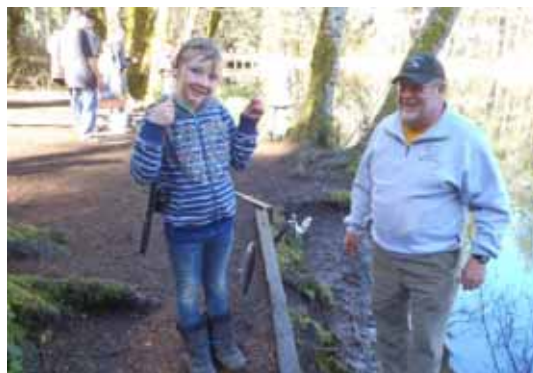
Volunteer with youth at Hebo Lake.

A Disabled Angler Fishing Day also occurred in conjunction with Camp Rosenbaum, the YMCA, and the Tillamook Anglers. Individuals from across the region come to Camp Rosenbaum and enjoy a day of fishing, fun, and a BBQ. Approximately 325 people with disabilities participated in this year's event.