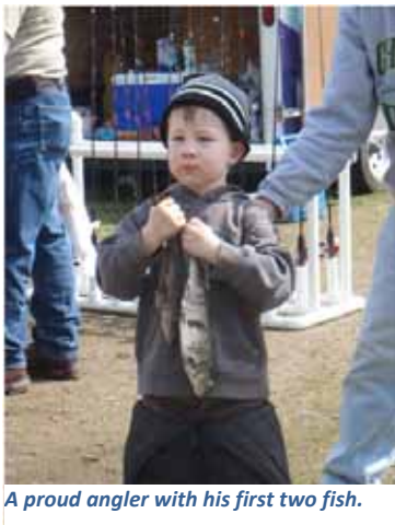
A proud angler with his first two fish.

STEP staff and volunteers hosted three Youth Angling Enhancement Program events located in Cottage Grove and Eugene. These events provided kids with the chance to check out a fishing rod, obtain instructions on casting, and to catch one of the many trout that were stocked in each of the locations. These events continue to become more popular and repeat participants are seen each year. The third event, held at Eugene's Alton Baker Park, occurred on Free Fishing Weekend in place of the event that had previously been held at the Leaburg Hatchery. The event was a huge success with approximately 600 participants.