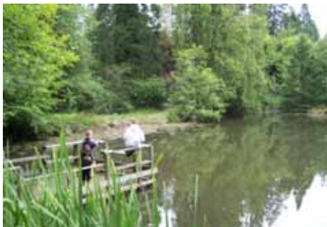
Kids Fishing at 4H pond.

Many school districts in the mid-Willamette district send students to outdoor schools and this has provided the STEP Biologist with additional educational opportunities for the program. The STEP Biologist, or STEP volunteers, participated in 15 Outdoor Schools/Days and summer camp fishing clinics, and four youth angling events. The STEP Biologist also taught fish biology at the Northwest Flytiers Expo; and taught salmon biology at three Salmon Walks sponsored by the