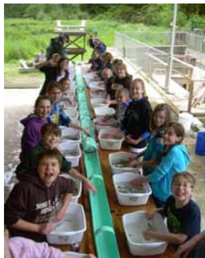
Kids helping fin clip (mark) fall Chinook.

Large numbers of Chinook salmon pre-smolts are released in the Coos River Basin. The premise behind the releases is the recognized limitation of spawning habitat in the Coos watershed that is available for Chinook salmon. Spawning habitat in the Coos began to be compromised in 1887 when the practice of splash-damming rivers started. Splash-damming was a process by which logging companies ran logs down the rivers during freshet events with the use of a large dam that was removed at a designated time. Prior to running logs down the river, logs and rocks that provided critical stream habitat were removed. This activity removed the river gravel that Chinook salmon needed for spawning. The Chinook salmon pre-smolts program in the Coos addresses the limited spawning habitat by producing large numbers of juveniles to utilize the Coos estuary. Coastal fall Chinook salmon rear almost extensively in coastal estuaries and the Coos estuary is the largest in Oregon. A total of 1,923,910 Chinook salmon pre-smolts were released into the Coos Basin in the spring of 2011. A total of 1,202,167 Chinook were marked in the spring of 2012 in the Coos basin. Most of the Chinook were marked by students.