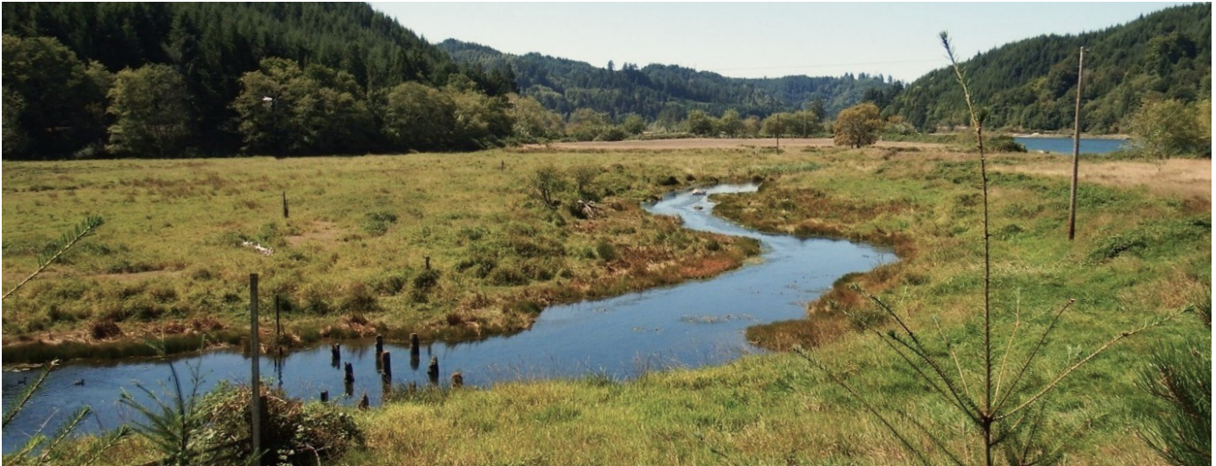
The Lower Smith Slough, one site of ODFW's Carbon Capture on Coastal Estuaries project (P5)

By mid-2026, the Commission will have adopted net carbon sequestration and storage goals. The agencies responsible for implementing natural climate solutions will have completed cross-agency work on natural climate solutions, associated metrics, and agency programs, and information they require to carry out the broad directives of the statute, which will inform Fund proposals. With this information, additional funding to facilitate the development of a cross-agency implementation plan would give the Commission and agencies a clear roadmap for future N&WL investments, and would help to accelerate project implementation with future Fund allocations.