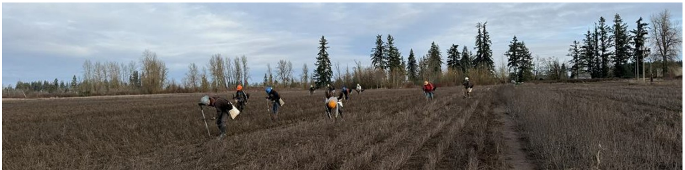
Contractor crew engaged in floodplain reforestation on the North Santiam River (P3)