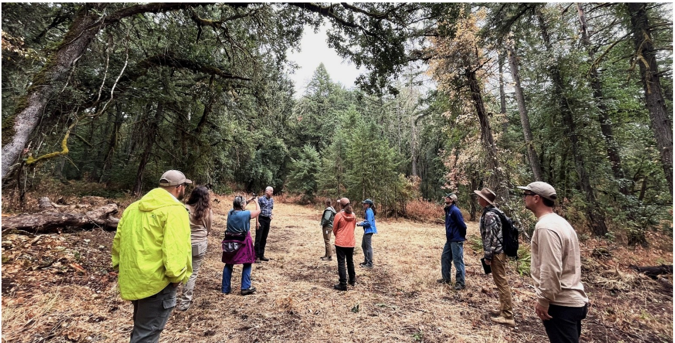
ODFW staff, Confederated Tribes of Warm Springs staff, and contractors on-site at the Red Hills Conservation Area Wildfire Risk Reduction Project (P6)