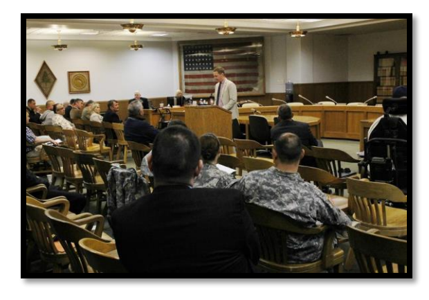
Military Appreciation Day

Additionally, SB 616-A was passed, which requires the Secretary of State to conduct investigations of Community Housing Trust Account within Developmental Disabilities Community Housing Fund to ensure the funds are used for the purpose for which they were designed.