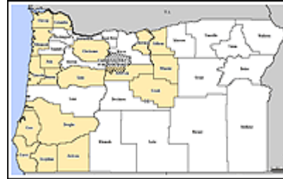
DR – 1672-Severe Winter Storms, Landslides-Mudslides