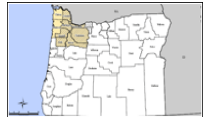
DR – 1824 Severe Winter Storm, Record and Near Record Snow, Landslides, and Mudslides