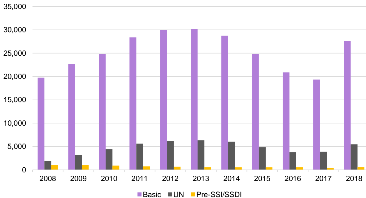
Figure 2. TANF Caseloads in Oregon, 2008 - 2018

Source: Legislative Policy and Research Office