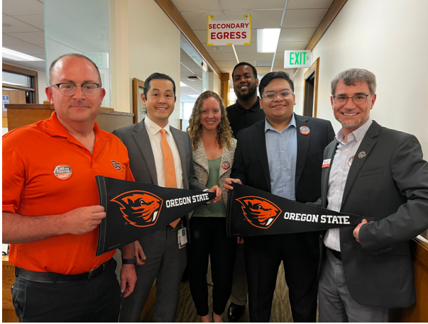
OSU Lobby Day