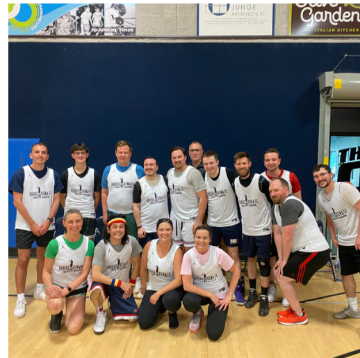
House Team #1 Group Picture

That's all the updates I got for you in Salem. Wishing you all a great week!