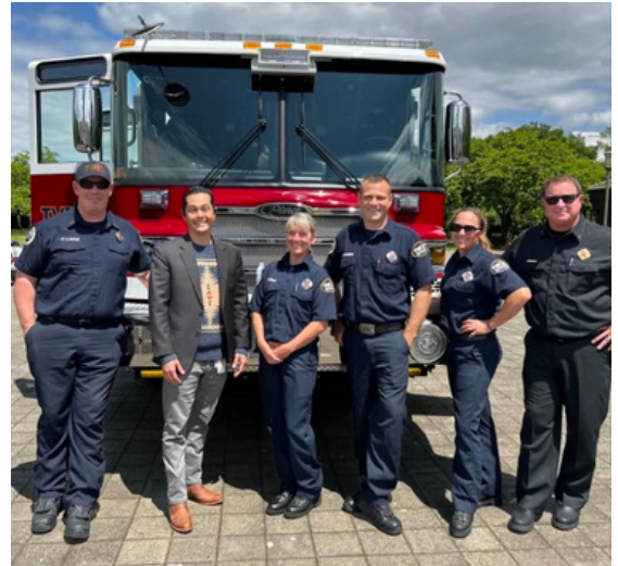
With local firefighters and paramedics of TVFR