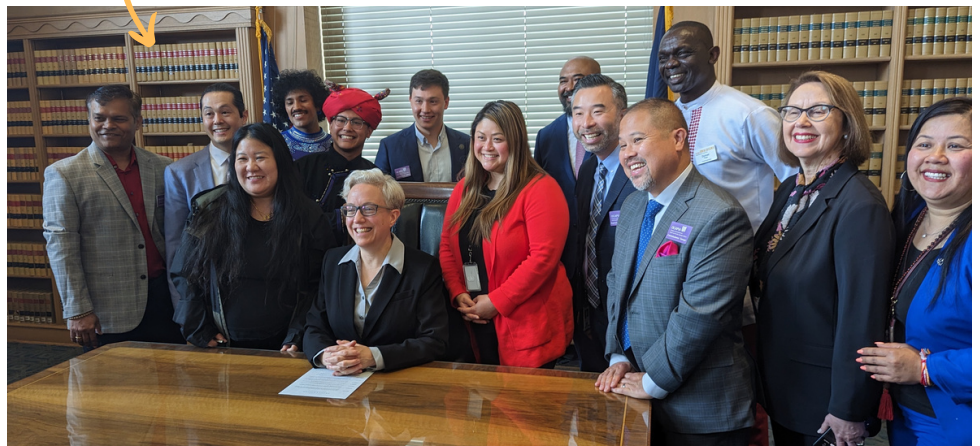
With Governor Kotek, legislators and community leaders for the AANHPI Proclamation.