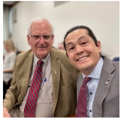
In Washington DC for the first White House Lunar New Year Event!