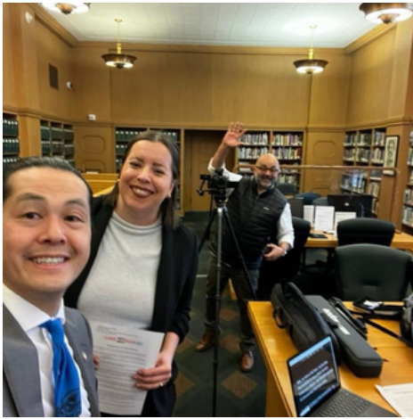
Selfie with the production team while filming a video in support of HB 3090 (a bill to prevent youth nicotine addiction)