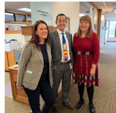
Rep. Schouten's visit to chat about public health investments!