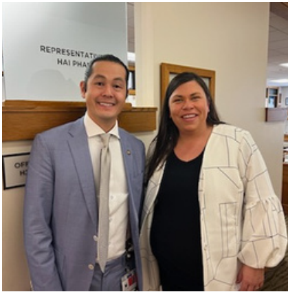
With Beaverton Mayor Lacey Beaty at my Capitol office