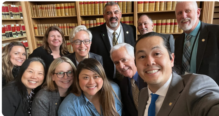
Lunch with Governor Kotek and other first-year legislators