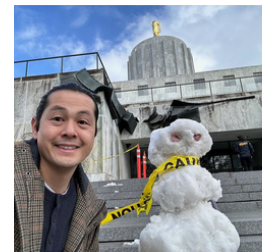
When life gives you snow, you make a snowman!