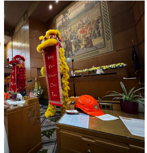
My oath of office and legislator pin!