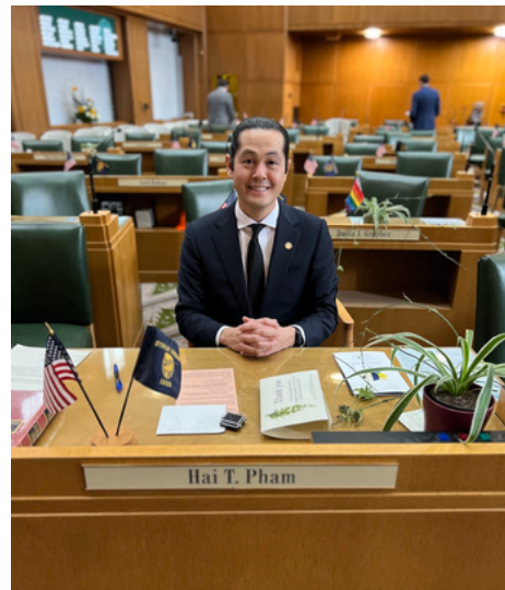
At my floor desk in the House Chamber.

I'm looking forward to working with this incredible group of legislators to address both the unique needs of our community and represent Oregonians across the state .