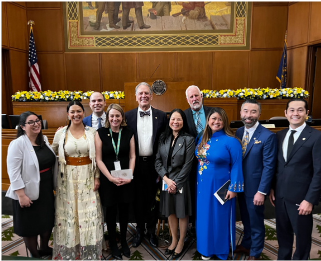
In the House Chamber with some of my new legislative colleagues.

After the swearing-in, we conducted our first official business of the session by electing officers, adopting rules, and hearing from our newly inaugurated Governor, Tina Kotek.