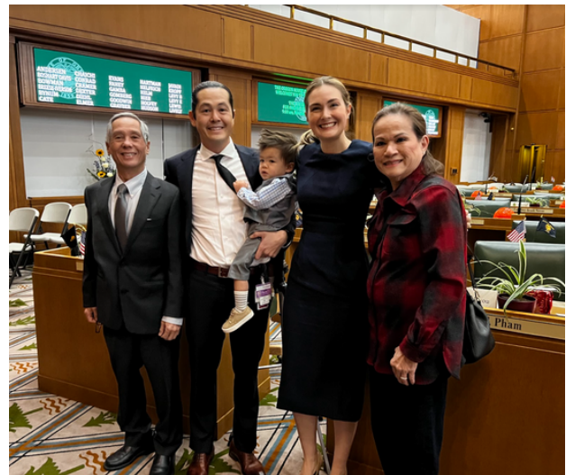
My family and I on Opening Day.

I am excited to get to work and enact meaningful legislation that will ensure an equitable recovery for ALL Oregonians and create a better future for our children.